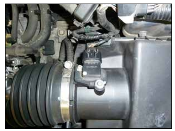
4. Disconnect the mass air sensor electrical connection.

3. Remove the clips that secure the drivers side front decorative cover and then remove the cover.