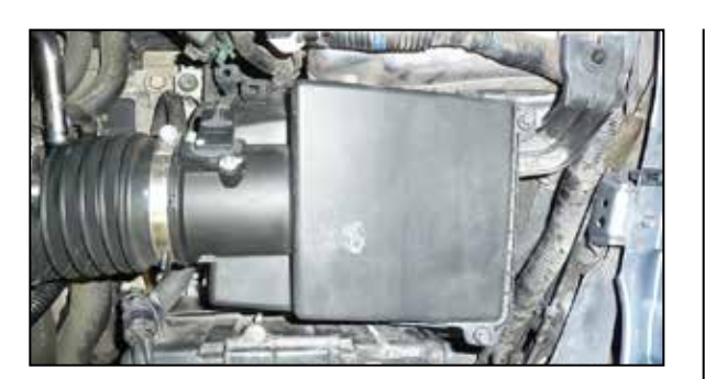
7. Loosen the four bolts that secure the upper air filter housing and then remove the upper housing and intake boot.

NOTE: AEM recommends that customers do not discard factory air intake.