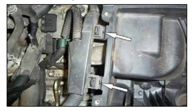
8. Unclip the wiring harness from the lower air filter housing.

NOTE: AEM recommends that customers do not discard factory air intake.