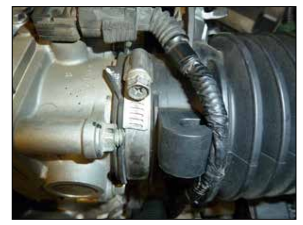
6. Loosen the hose clamp that secures the factory intake boot to the throttle body.