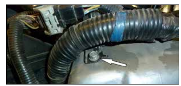
13. Remove the wiring harness mounting bolt shown on the shock tower.

12. Install the edge trim onto the heat shield as shown.