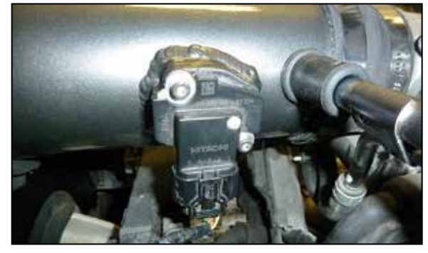
17. Reconnect the mass air sensor electrical connection.

16. Install the AEM<sup>®</sup> intake tube into the heat shield and then into the coupler, adjust the tube for best fit and secure with the provided hardware.