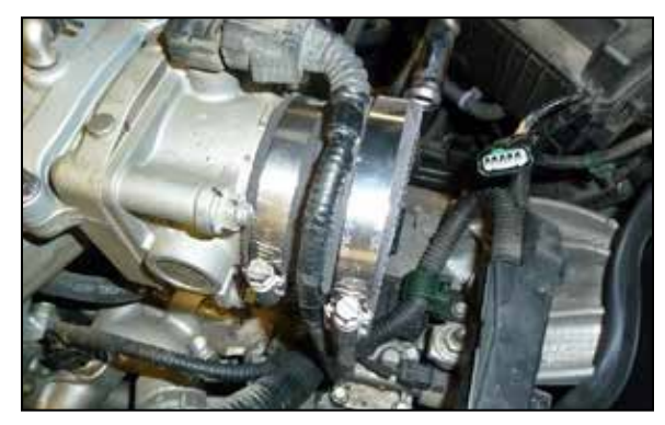
15. Install the provided coupler (084034) onto the throttle body and secure with the provided hose clamps.

NOTE: It may be necessary to move the wiring harness to access the bolt to secure the heat shield.