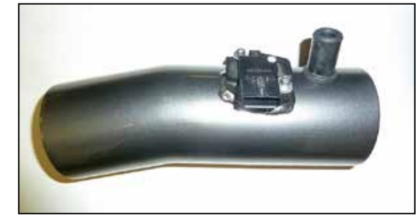
10. Remove the mass air sensor from factory air filter housing and then install into the AEM<sup>®</sup> intake tube and secure with the provided hardware. Install the crank case vent adapter grommet into the AEM<sup>®</sup> intake tube as shown.

NOTE: It may be necessary to loosen the battery hold down and slide the battery back to access the air box mounting bolt.