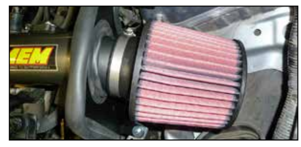
18. Install the AEM<sup>®</sup> air filter onto the intake tube and secure with the provided hose clamp.